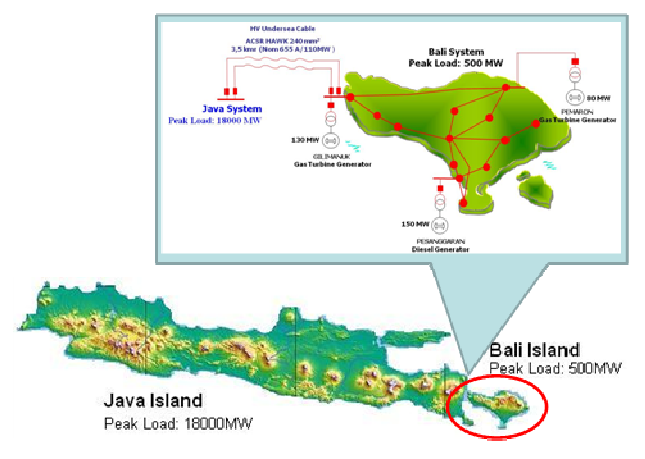
Fig. 1: Java Bali Interconnection

The island of Bali in Indonesia, is one of the favourite tourism destination in the world. It has cultural diversity and beautiful beaches supporting so tourism as the main business in Bali. This island is located in the east of Java, the main island in Indonesia.