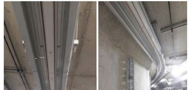
Fig.1: Power line communication Rail

casting aluminum that is resistant to light and corrosion. And it is constructed with structure that can protect robot from object fallen from ceiling of the tunnel. The rail performs the transmission of image, the communication for controlling device and the power supply function. So the system does not need the additional communication or power line. It is designed to use DC 24V in order not to cause safety accident such as electric shock.