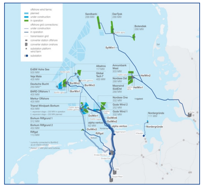
Fig1: Overview of the Offshore Grid Connections

Starting in 2006 with the connection of Germany's first offshore wind farm (OWF) alpha ventus, TenneT has been building various connections of OWF to the German grid (Fig.1).