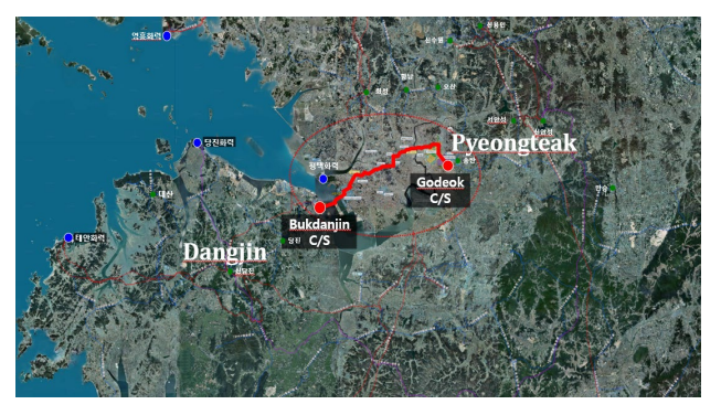
Fig. 1: Bukdangjin – Godeok HVDC Project

The aim of Bukdangjin-Godeok HVDC Project is tranmit electric power generated from power plants in South Korea's west area including Dangjin thermal plant to area in the capital, which lack power plants. It consists of two converter stations, Bukdangjin Station in Dangjin and Godeok station in Pyeongtaek, and ±500 kV HVDC transmission line between two converter stations. It is LCC (line commutated converter) bi-pole HVDC system and will transmit up to 3 GW of power.