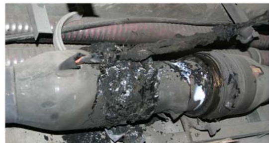
(a) Failure cable accessory

Recent researches of SIR mainly focus on the short-term characteristics, such as the influence of frequency [1], cracks [2], curvature radius [2] and temperature [3, 4] on electrical tree and electrical property of SIR. Electrical treeing growth is closely related to its partial discharge (PD) characteristics [5 - 7]. Meanwhile, the growth can also be characterized by microcosmic physical parameter and chemical structure [8, 9]. In SIR, however, the process of electrical treeing initiation and propagation is unclear. To reveal the role of PD in electrical treeing growth, not only PD characteristics need to be studied, but also physical and chemical characteristics of discharge channels should be combined.