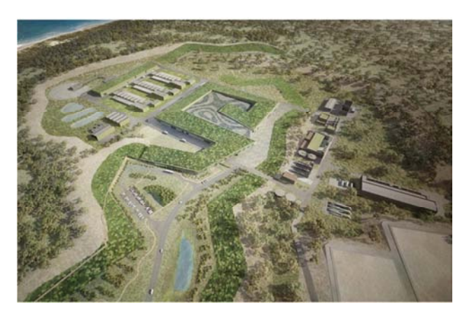
Figure 2: Victorian Desalination Plant

The plant is connected to Victoria's water and power networks via an 84 km transfer pipeline and an 88 km underground transmission line. The transfer pipeline and underground transmission line are both rated for the ultimate capacity of the plant and share the same easement for most of their length. The project also included a Booster Pump Station and a shunt reactor station at SRCS.