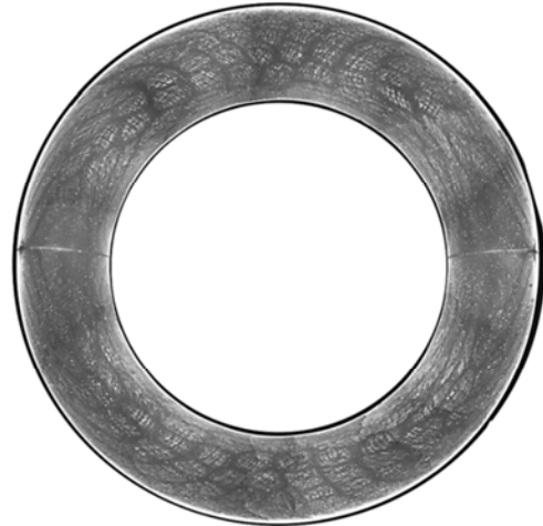
Fig. 1. Large-scale structure of medium-voltage cable insulation.

One of the essential conditions for reliable operation of the polyethylene insulation is its homogeneity. Numerous light microscope observations of insulation slices indicate that optically the insulation is practically always heterogeneous (Fig. 1).