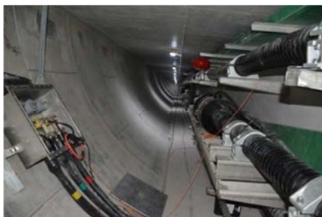
Figure 1: Beijing 500kV Cable tunnel

Beijing 500kV power cable line was a double circuit line with 6.7km cable length. One circuit was made with local manufactured cable and accessories; the other one was imported from France. Cable conductor cross section was 2,500mm 2 . Cable line was installed under cable tunnel conditions as shown in figure 1. Four cross bonding sections were used for grounding system. Each phase had 11 cable joints, 1 GWAS termination and 1 outdoor termination. The installation was finished in May 2014. Acceptance tests were performed in June 2014.