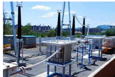
Figure 2: Four test systems operated in parallel and series mode

distributed PD monitoring system made by SINDIA were used in China. Finally, this was the first time to apply 493kV test voltage for 1 hour on large length transmission power cables. This test had influenced the test standards of extra HV cable acceptance tests in China.