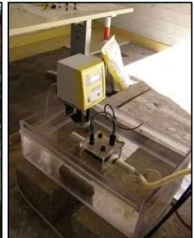
Figure 3: power amplifier