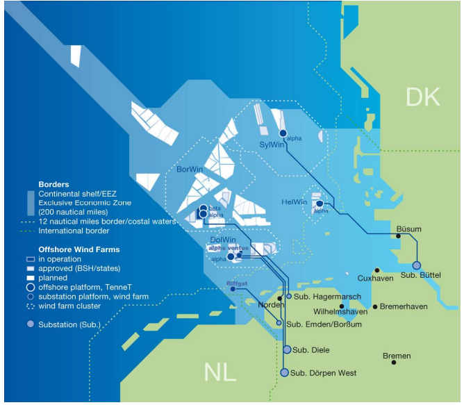
Fig. 1 Geographical division of the planned OWP into four clusters with the allocated transmission routes and NVP in the substations (stand 03.2011)

For the realization of those projects there are following criteria to meet [1]: