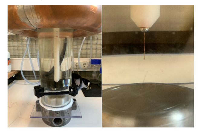
Figure 2: Device under test – Tip-plate-arrangement

The DUT in this case is an abstract model of a cable termination with an artificial failure inside. In an acrylic cylinder there is a tip-plate arrangement. The tip is at high voltage potential and the rounded electrode is at ground potential. The acrylic cylinder is filled with silicone oil, as shown in Figure 2.