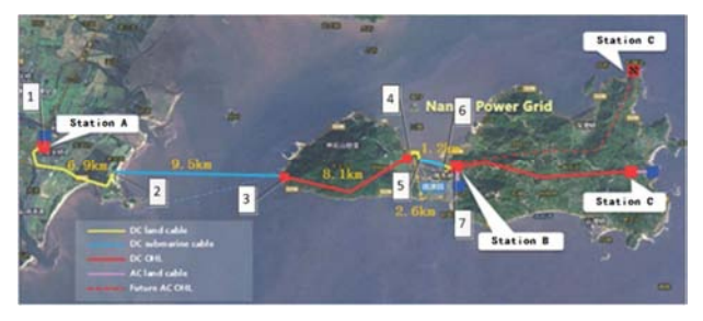
Fig.1: Nan-ao VSC-HVDC pilot project configuration

The configuration of the Nan-ao project is illustrated in Fig.1. The transmission line between Station A and Station B comprises \pm 160 \text{kV} HVDC land and submarine cables and overhead lines with the total length of 28.3 km. The transmission line between points 1 and 2, 4 and 5 and points 6 and 7 are land DC cables, the total length of 9.5 km. And points between 2 and 3 and Points 5 and 6 are two sections of submarine DC cables and their lengths are 9.5 km and 1.2 km respectively. Overhead line with length of about 8.1 km is between points 3 and 4. The maximum water depth of the submarine cable laying seabed is about 15 m. Station B and C is connected by an \pm 160 kV HVDC overhead line with length of 12.5 km.