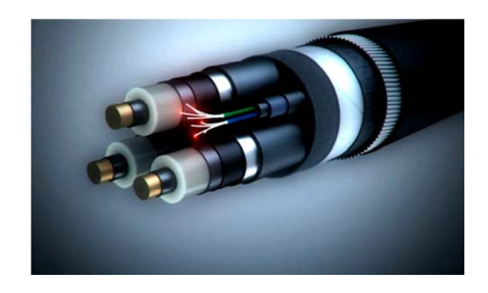
Fig. 2: fibre optic cable integrated into a power cable. Primarily used for communications, but strands are usually available for sensing.

The first commercial Distributed Temperature Sensing Systems were based on Raman scattering techniques. Using multimode optical fibre placed beside or integrated into the power cable.