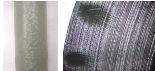
Fig. 1: Water Tree in XLPE Insulated Cables

The XLPE cables operated in frequently water logged conditions could exhibit lots of white dots in their insulation layer (Fig. 1). As shown in the cross section picture of Fig. 1, so-called "water tree", the micro voids shape like tree branch or chestnut bur and water is filled in. The moisture from surrounding the surface of XLPE is forced to penetrate by electric field and propagate into the XLPE while making micro void paths filled with water. This phenomenon continues and the water trees grow through the thickness of insulating layer. In conclusion, conductible path is formed from the concentric layer to the core or in the reverse way and cable breakdown occur as a result of flowing conductive current through the path. Fig. 2 shows that the more water tree is growing, the less dielectric strength is. This consequence takes time about more than 10 years.