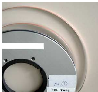
Fig. 1: A sample of HTS tape with FCL properties

An important characteristic of HTS cables is their high transport capacity. HTS cables can transport up to 10 times more power than conventional cables of comparable radial dimension. This feature is supported by the fact that nowadays a long length commercial HTS tape conductor of the latest generation (see Fig. 1) can carry 300 A/mm 2 when cooled to 77 Kelvin.