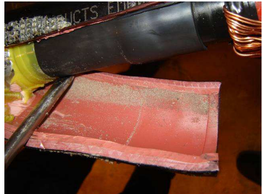
Fig. 1 Example of insufficient installation of a MV joint

This approach has proven to be successful. In figure 1 an example of poor workmanship can be seen because of the presence of sand within the joint body which has been found by PD measurement. Besides after laying tests, Liander is also involved in the training of contractors and employees to improve installation work and to minimize failures caused by poor workmanship.