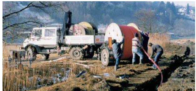
Fig. 1: After laying, a cable is tested for problem-free operation

Cable testing is done according to the VDE (Verband der Elektrotechnik Elektronik Informationstechnik e.V.) on XLPE cables with 3xU_0 (VLF) for 1 h. This test after laying a new cable (Fig. 1) or restoration of a cable line conveys if the cable endures the test voltage at the time of testing. It is a pure function test and a positive result indicates no damage in the old cables.