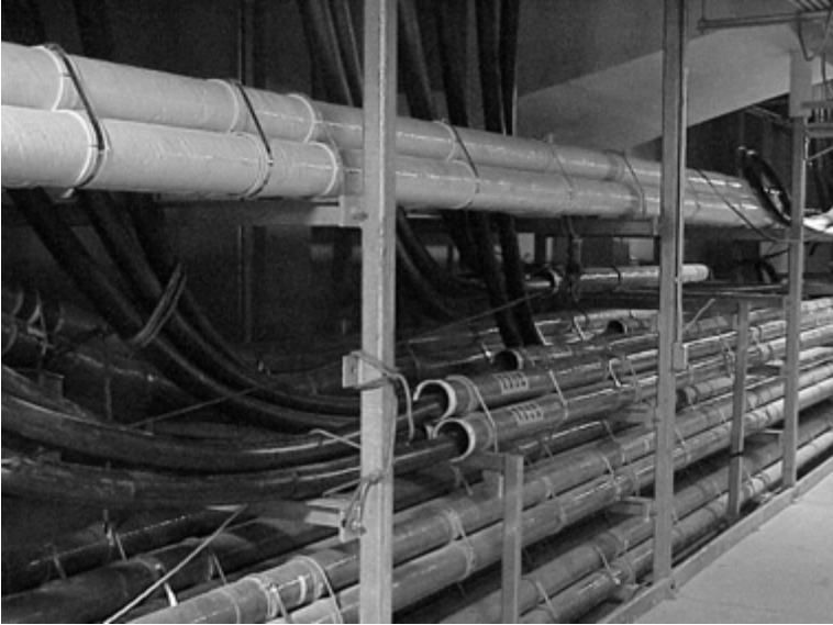
Fig. 1. Cables installed in special ducts rigidly clamped in a trefoil configuration (west side)